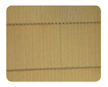
Figure 2: ForTii LDS fine line capability

DSM now has a series of LDS materials; all based on polyamide 4T and branded ForTii. Compared to rival liquid crystal plastic (LCP) materials suitable for LDS, ForTii grades are lower in cost and offers excellent plating behavior (see figure 2), weld line strength (see figure 3) as well as dielectric properties. With some materials, the variability in the plating process when